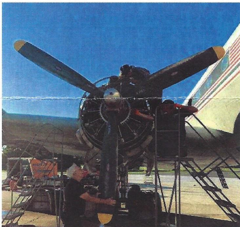
CHECKING THE #3 ENGINE IGNITION TIMING

While both transports are basically the same, there are many differences. The inspection now in progress is our #3 Service Inspection which is a comprehensive total inspection of the entire C-54. Our replacement C-54D being an unknown transport to us, it is essential this inspection be performed in minute detail to insure it is ready and safe to fly.